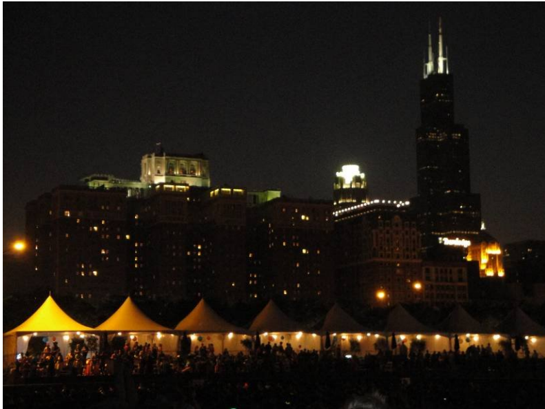
Chicago's skyline from the 2016 Stage.

Lollapalooza ended with two more highly anticipated headliners: Jane's Addiction and The Killers. Perhaps one of the harder decisions of the weekend, many fans decided to split their time between the two and make the dash across Grant Park.